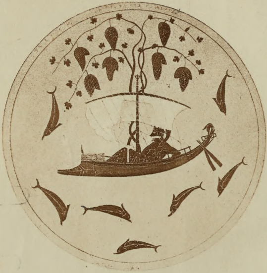
DIONYSUS CROSSING THE SEA. FROM GERHARD AUERLESENE VASENBILDER.